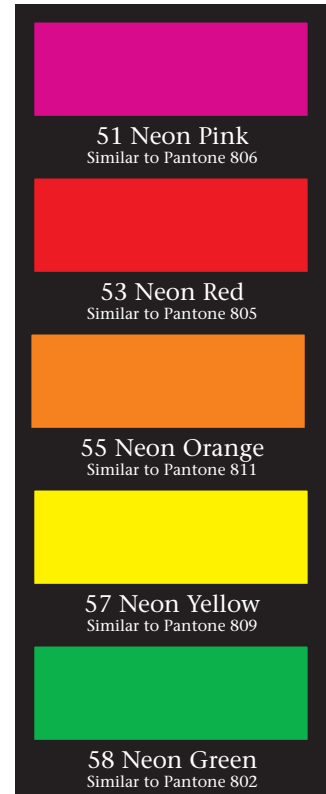
51 Neon Pink Similar to Pantone 806